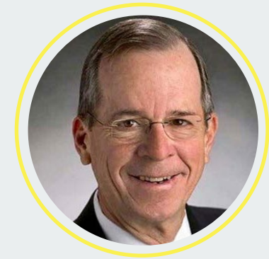
Admiral Michael G. Mullen, U.S. Navy (Ret.)

Co-Founder of LinkedIn, Co-Founder of Inflection AI, Partner at Greylock