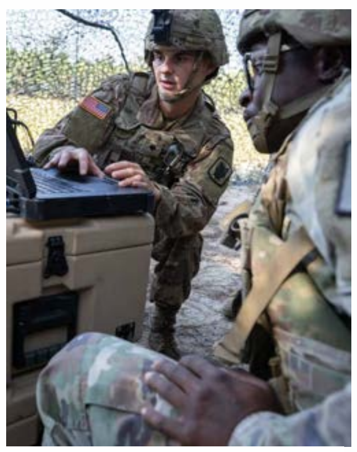
The 50<sup>th</sup> Expeditionary Signal Battalion conducted a combined Large Scale Combat Operations (LCSO) communications exercise on Fort Liberty, North Carolina as part of recurring Scarlet Dragon Oasis Alenabled live-fire target identification exercises.